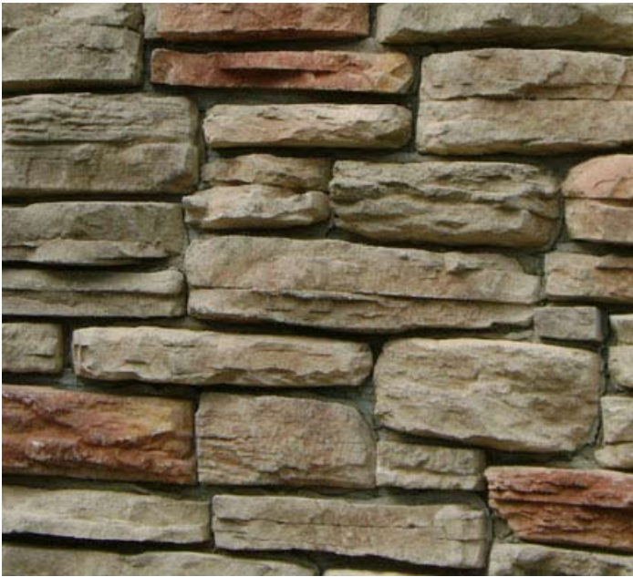
Pennsylvania Ledge #28020025

Drawn By: Centurion Stone Date: Revised: Scale: NOT TO SCALE Checked by: Sheet: 1 of 1