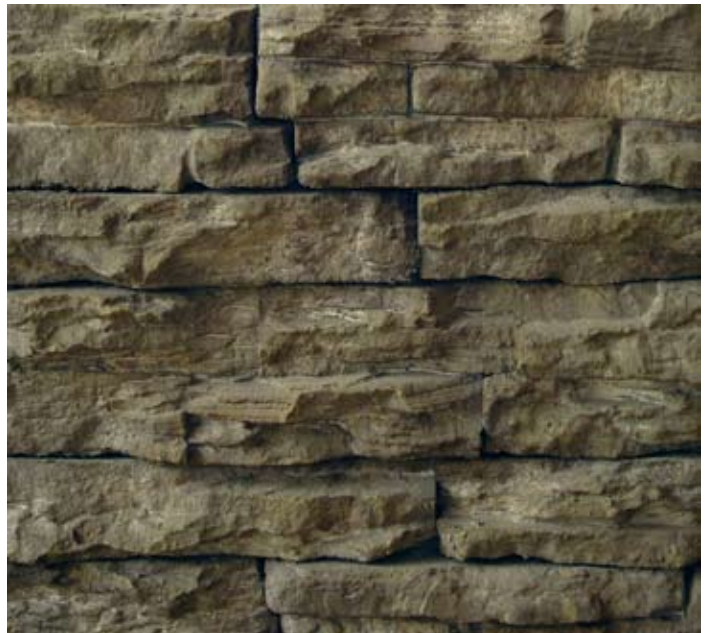
Appalachian Multi-Blend #17025015

Drawn By: Centurion Stone Date: Revised: Scale: NOT TO SCALE Checked by: Sheet: 1 of 1