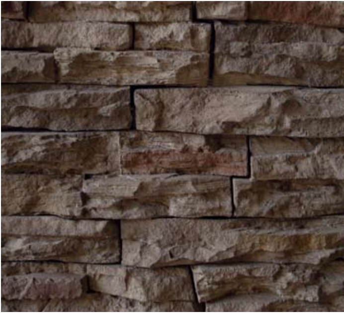
Pennsylvania Multi-Blend #17080025