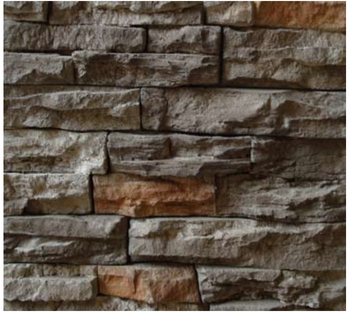
Kentucky Multi-Blend #17026015