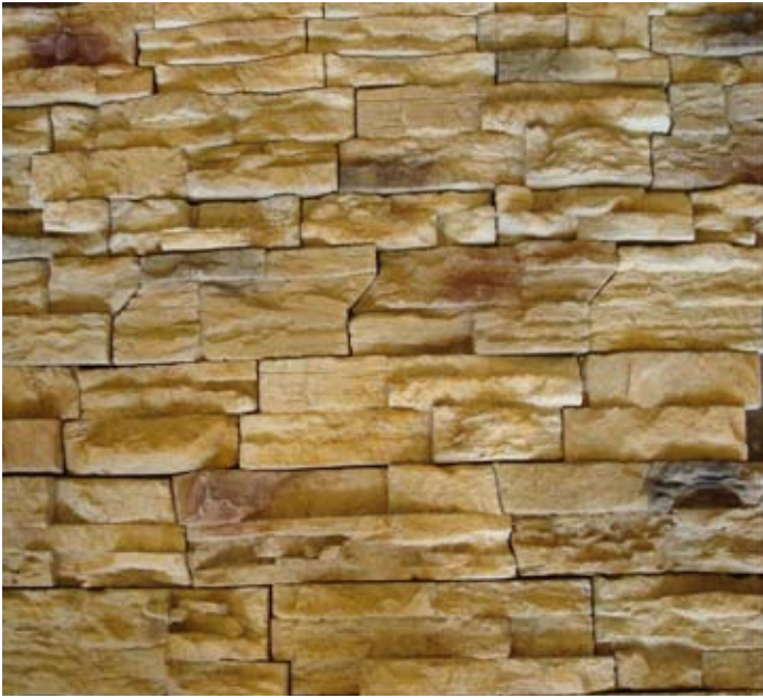
Oskaloosa Multi-Blend #17041525

Drawn By: Centurion Stone Date: Revised: Scale: NOT TO SCALE Checked by: Sheet: 1 of 1