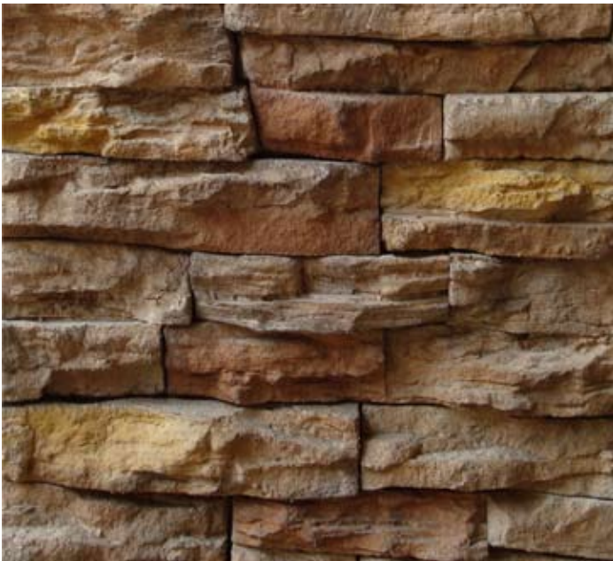
Brown Multi-Blend #17020025