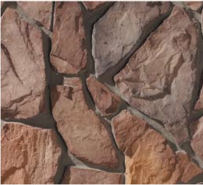
Arkansas Palos Verde #04017065