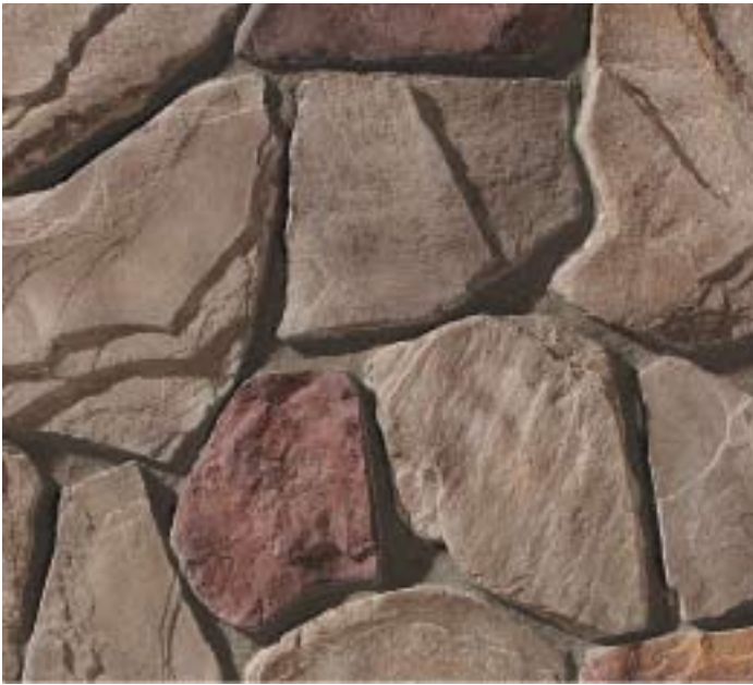
Pennsylvania Palos Verde #04080025

Drawn By: Centurion Stone Date: Revised: Scale: NOT TO SCALE Checked by: Sheet: 1 of 1