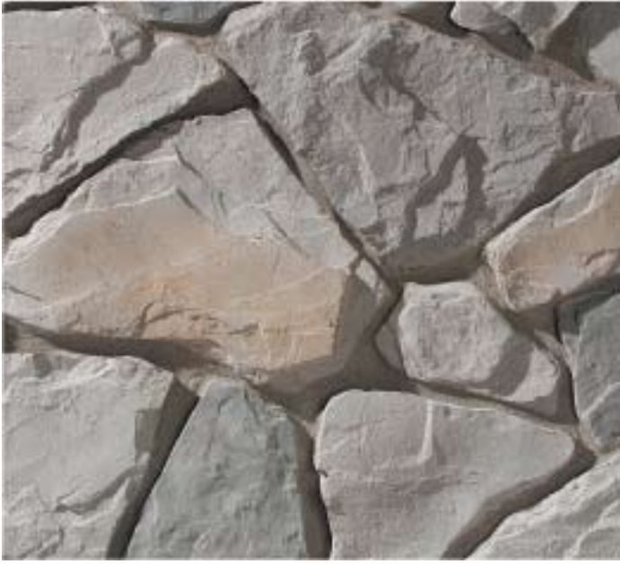
Gray Palos Verde #04003045