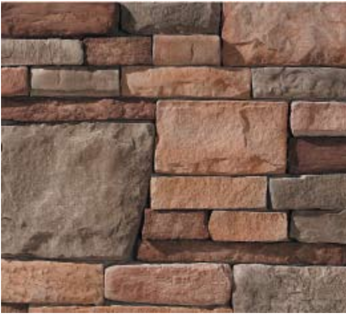
Arizona Rustic #?