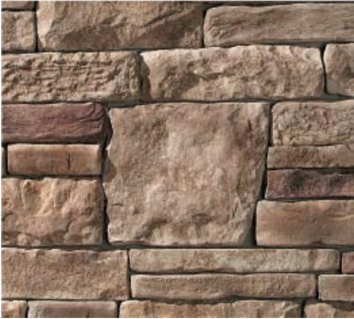
Pennsylvania Rustic #?

Drawn By: Centurion Stone Date: Revised: Scale: NOT TO SCALE Checked by: Sheet: 1 of 1