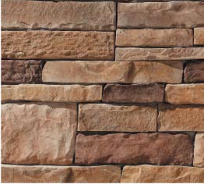
Brown Rustic #?