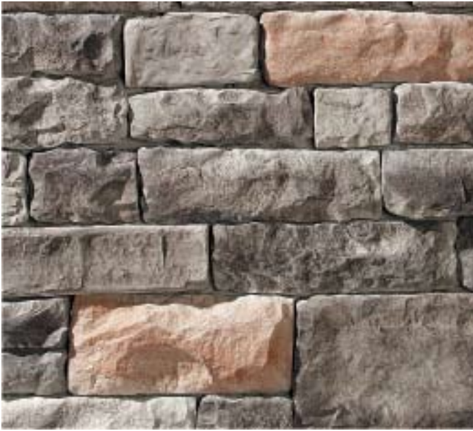
Kentucky Rustic #?