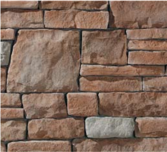
California Rustic #?