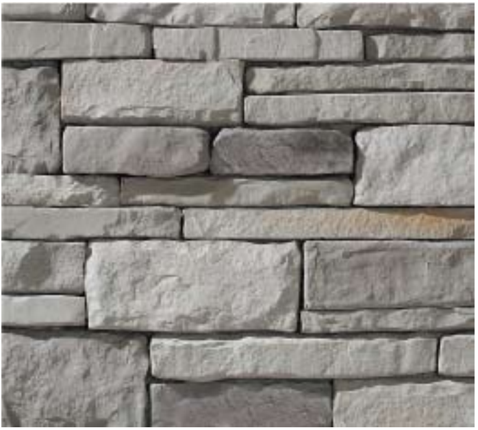
Gray Rustic #?

Drawn By: Centurion Stone Date: Revised: Scale: NOT TO SCALE Checked by: Sheet: 1 of 1