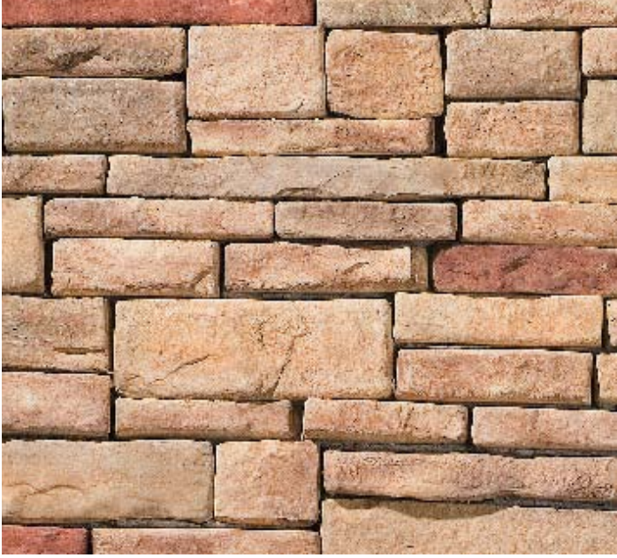
Chardonay Stack #10018065

Drawn By: Centurion Stone Date: Revised: Scale: NOT TO SCALE Checked by: Sheet: 1 of 1