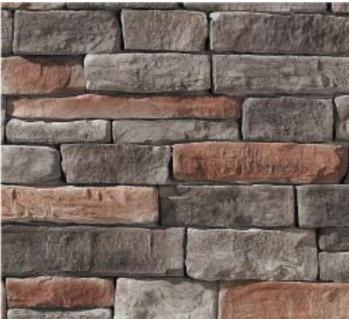
Kentucky Stack #10026015