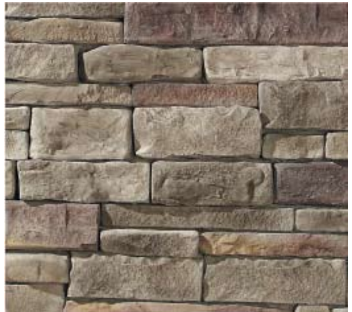
Pennsylvania Stack #10080025

Drawn By: Centurion Stone Date: Revised: Scale: NOT TO SCALE Checked by: Sheet: 1 of 1