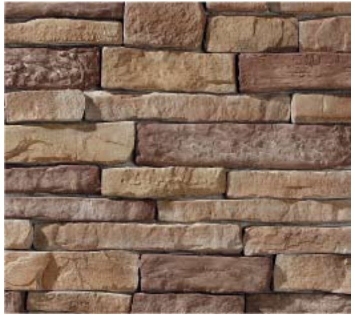
Brown Stack #10020025