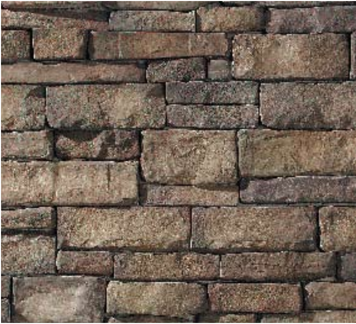
Appalachian Stack #10025015