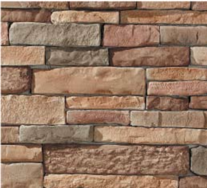
Arizona Stack #10072425