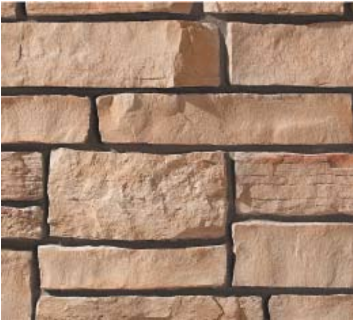
Blonde Weatheredge #26065025