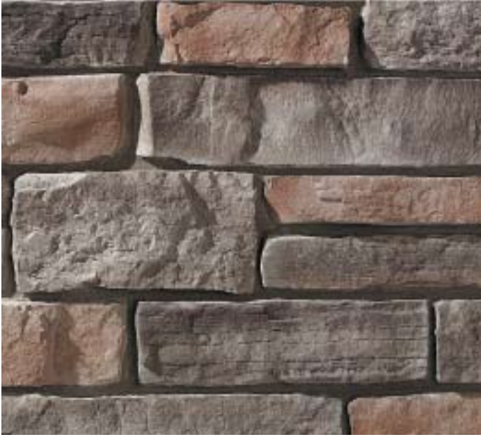
Kentucky Weatheredge #26026015

Drawn By: Centurion Stone Date: Revised: Scale: NOT TO SCALE Checked by: Sheet: 1 of 1