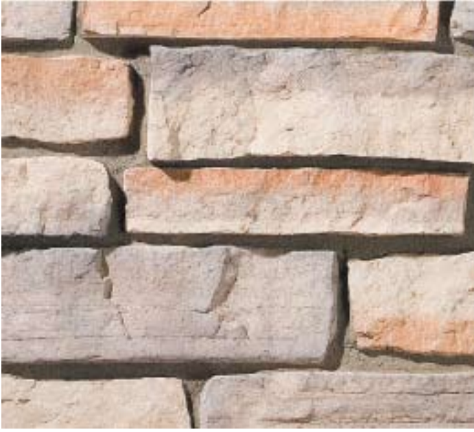
Blue Bayou Weatheredge #26033520